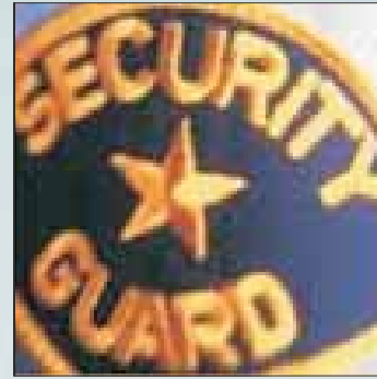
Security with intercom