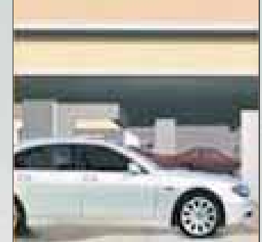
Adequate Car park