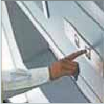
Lift with backup generator