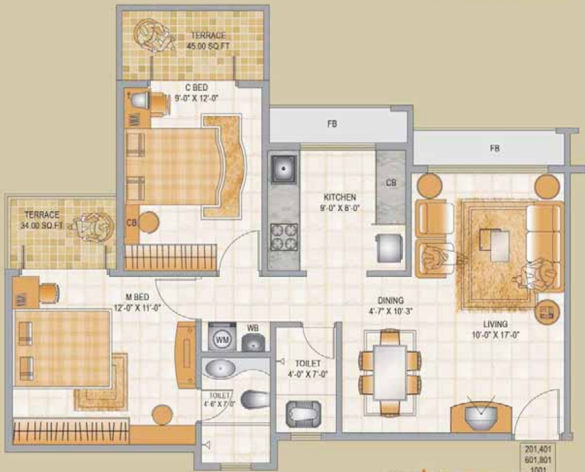
TYPICAL FLOOR PLAN (EVEN) (2nd, 4th, 8th, 8th & 10th)